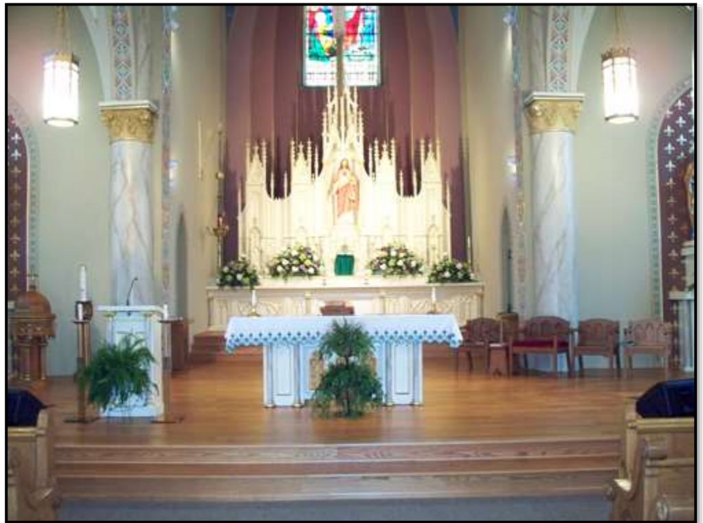
The Main Altars for St. Peter's Church as it appears now.