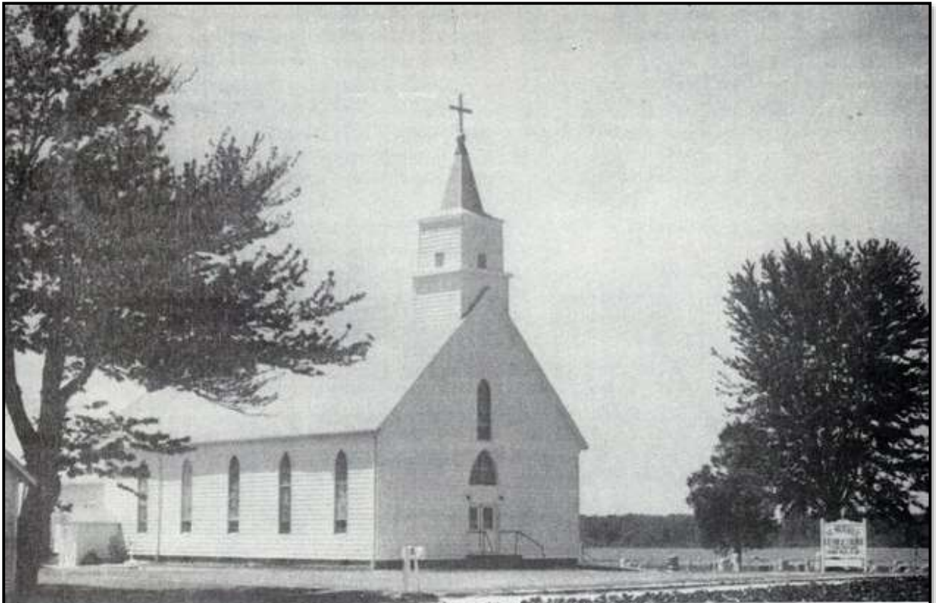
ST. MICHAEL'S CHURCH IN 1988

View of St. Michael's Church looking Northwest from the southeast. This small country church had a priest's house at one time along with a dining hall in the basement of the church along with a cemetery on the north side of the church. The Michaels and the Matthews attended this church for many years before the older generation passed away and the younger generation moved closer to Montgomery and attended St. Peters Church. The Church was closed in the 1990's and was torn down not long after that. The memories linger on for many who remember what the church meant to each family.